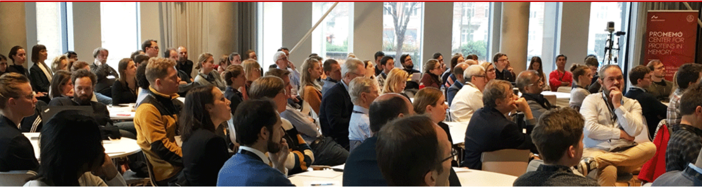
Proteins and Circuits in Memory.