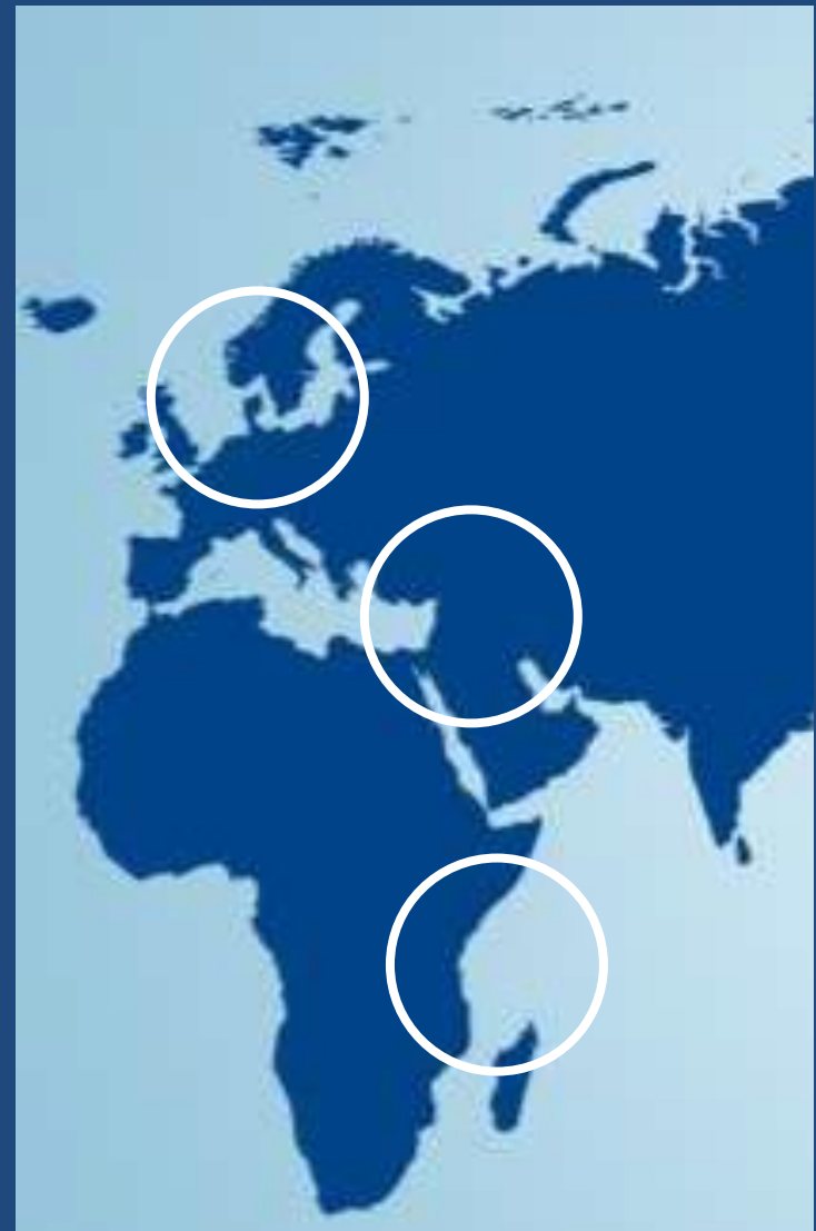
Work Packages, conceptual agendas and study regions of UrbNet