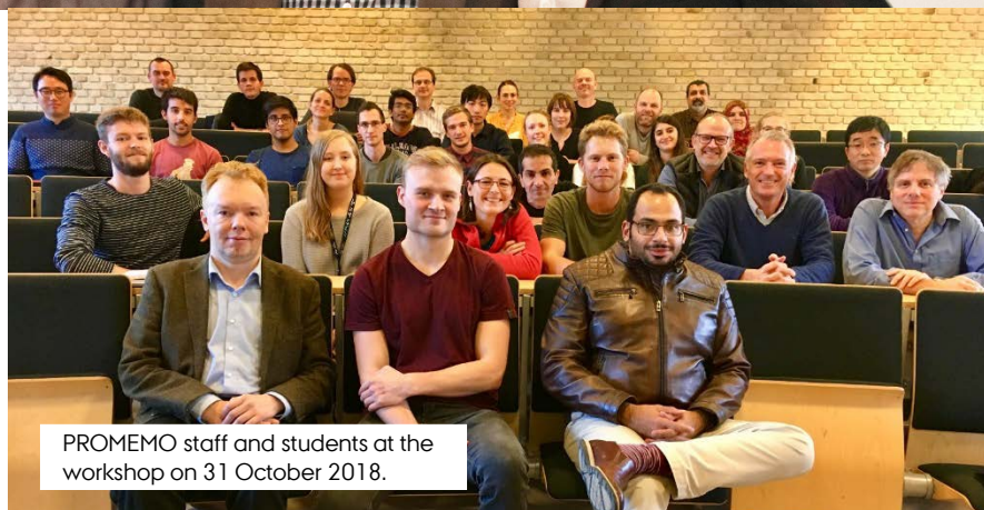
PROMEMO staff and students at the workshop on 31 October 2018.

The workshop will be a quarterly recurring event.